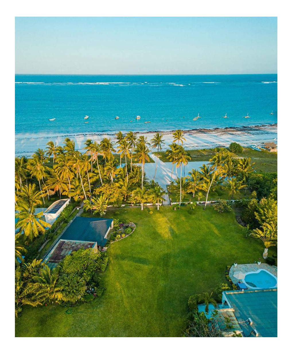
On behalf of the entire team at Mzima Beach resort, we would like to express our heartfelt gratitude for your support over the years and are truly honored to have been your home away from home. Our 2022 highlights are: